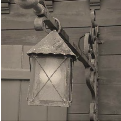
Image 1.22 Front entry lantern

and all boxes and brackets should be scraped primed and painted. Automatic watering systems at the second floor should be evaluated and reconnected.