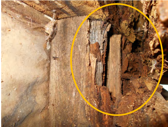
Image 1.16 Deteriorated exterior wall at kitchen

Four cantilevered roof corner locations and seven sidewall roof edge locations were supported by built-up stacked vertical wall brackets built in the Swiss Chalet architectural style. Another three roof corners (one at the kitchen and two at the north end of home) are supported with beams with diagonal braces to wood support columns.