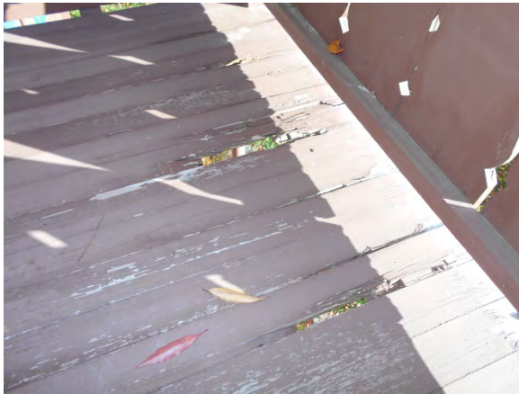
Image 1.11 View of the deteriorated balcony deck at the east