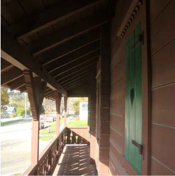
Image 1.10 View of the south balcony