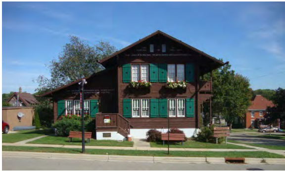
Image 1.2 Street view of the Chalet of the Golden Fleece

The purpose of conducting the research, observations and analysis for the Chalet of the Golden Fleece is to provide an opinion on the general condition, architectural integrity and possible rehabilitation of the property.