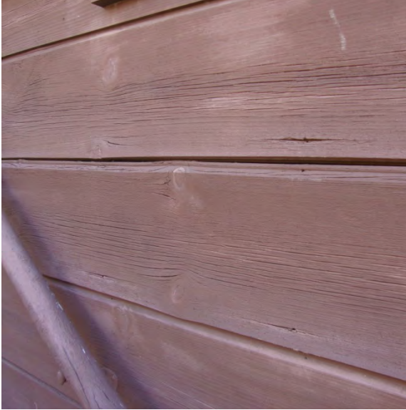
Image 1.9 Cupping and open grain of siding on west façade of Chalet