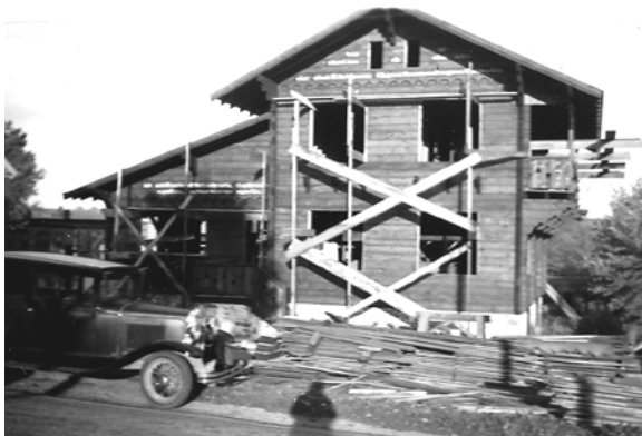
Image 1.3 Construction of the Chalet 1937.