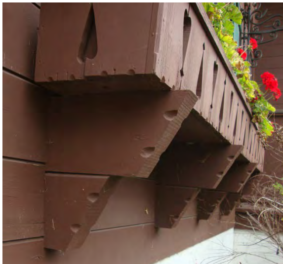
Image 1.14 Front window box and bracket

The window boxes are a traditional element of the Chalet revival style of residential architecture. These were originally created to romanticize the picturesque alpine locations of the prototype chalets. The window boxes on the chalet are well built with galvanized liners and sturdy support brackets. These are in good overall condition with some deterioration due to age and weather exposure. The brackets appear to be functioning adequately.