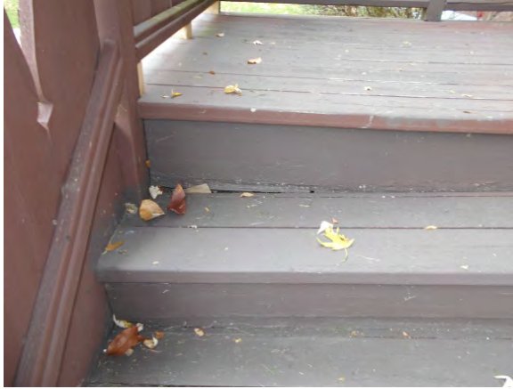
Image 1.21 Deteriorated front porch steps

It is recommended that the front and side porches be repaired. This will require at least partial disassembly. Damaged wood framing should be replaced. Loose railings and posts should be reinforced or replaced.