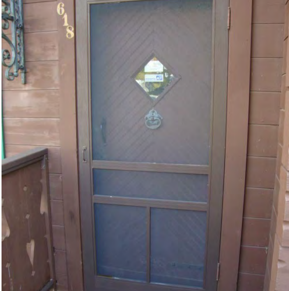
Image 1.13 View of front door with screen door.